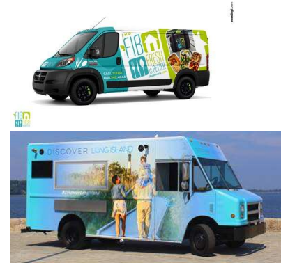
OPTION D (Van/Truck Conversion)