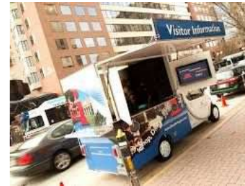
OPTION C (Pop-up Library Model)