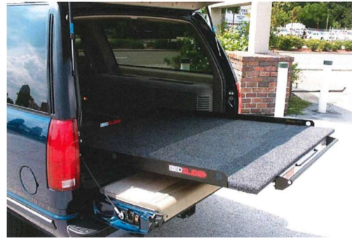
OPTION B- SUV with Slide-outs